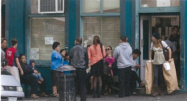
Queue outside Auckland City mission awaiting food parcels.

Come Holy Spirit, and show us what is true